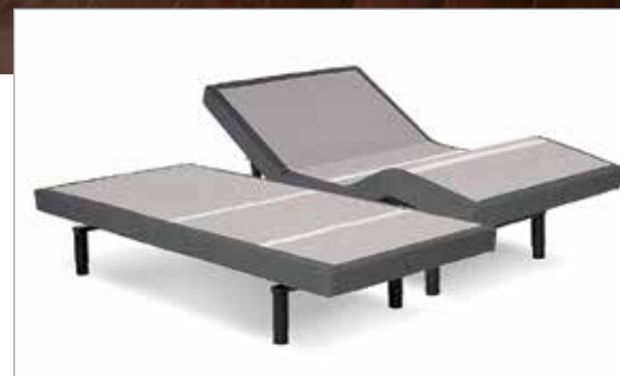
HIGH-PERFORMANCE ADJUSTABLE MOTION BASE