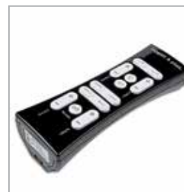
BACKLIT WIRELESS REMOTE